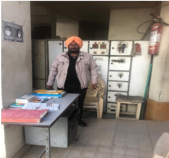
Safety and Security( 7.1.1)