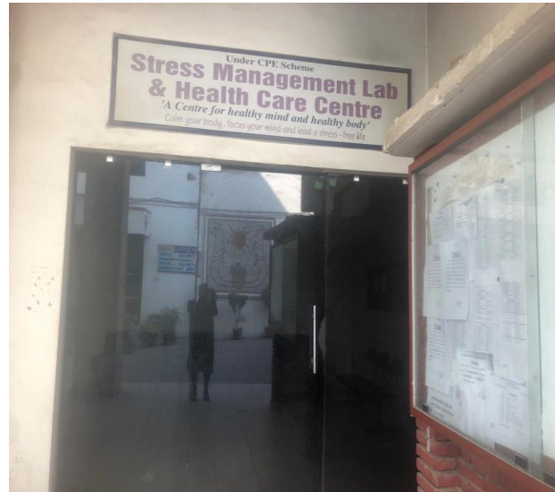
Stress Maangement Lab( 7.1.1)