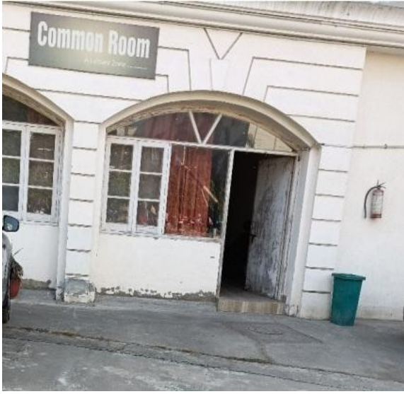
Common Room (7.1.1)